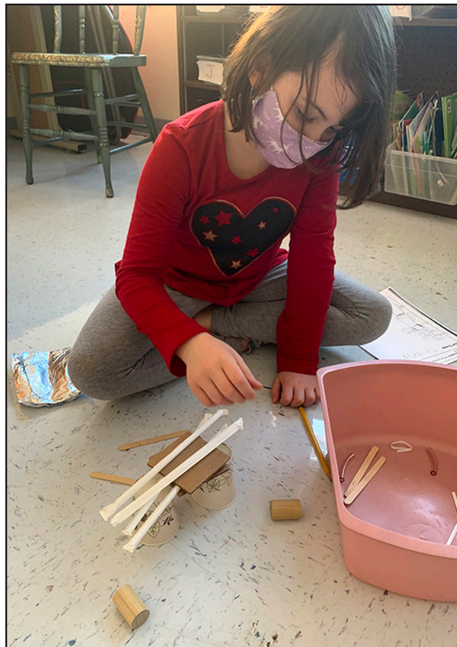
Second-graders are studying solids in science. For one project, they had 15 minutes to build a tower out of assigned materials (pictured). In another lesson, they will build bridges with the same materials.